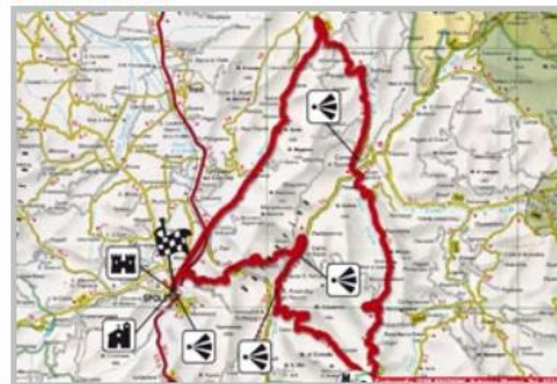
Cartografia Iter Edizioni , Subiaco (Roma). Tel. 0774/84900